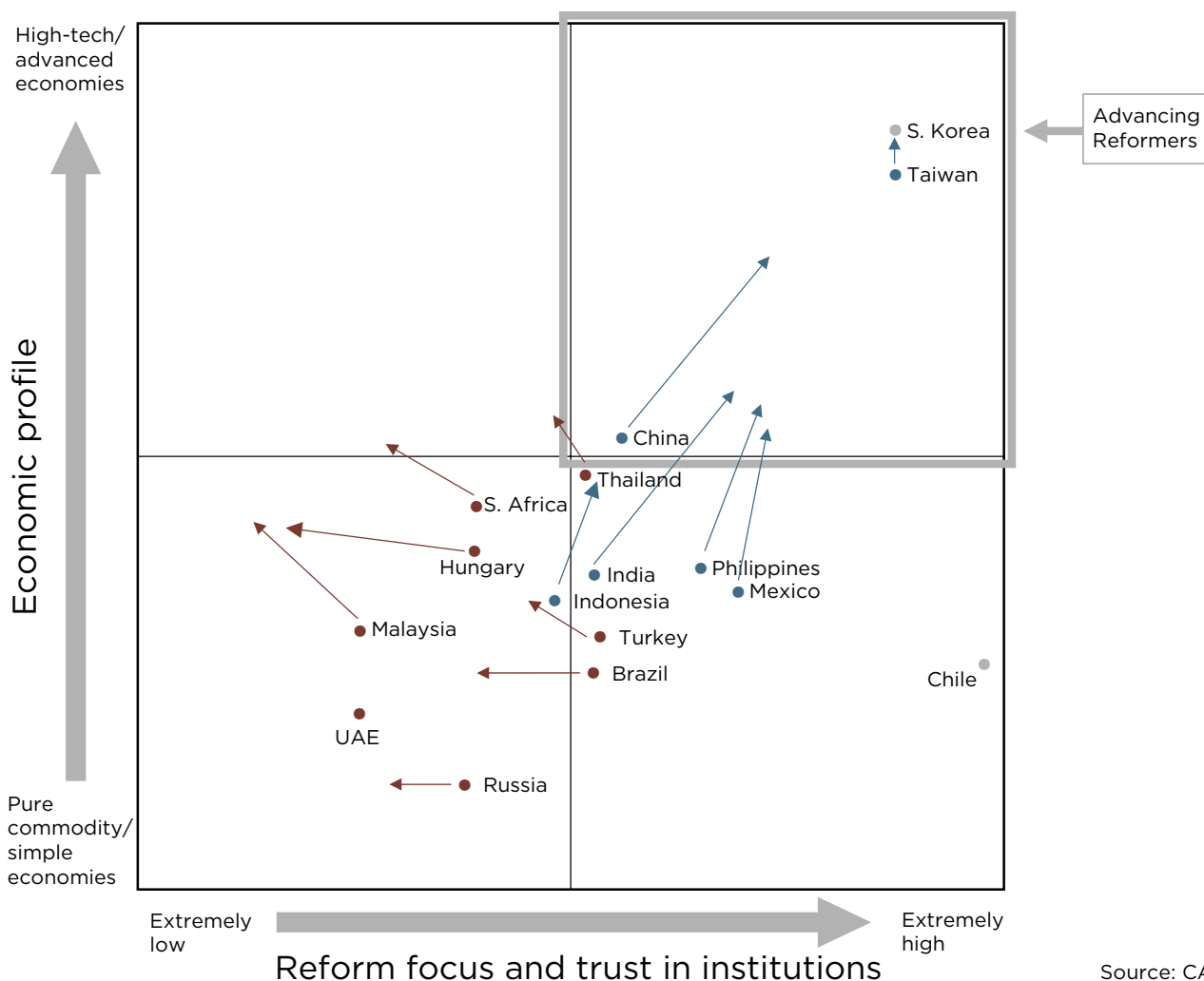
Economic “advancement” vs. structural reform implementation